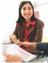
Director of Finance

The days enlighten by sharing valuable insights into every day professional life in stimulating, engaging and participant friendly ways. All participants enjoy the quality of the rezolv materials – including personal diagnostics.